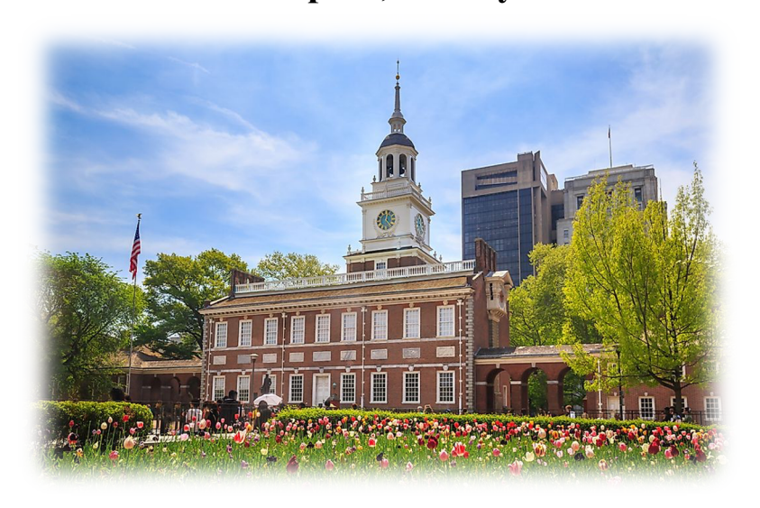
Independence Hall, (erected 1753)

Freedom Watch's Third Continental Congress, taking place on July 5<sup>th</sup> and 6<sup>th</sup>, 2021, exactly 245 years after our Founding Fathers and the colonies declared our independence for the first time, will be held in the Visitors Center across from Independence Hall in the birthplace of liberty, Philadelphia, Pennsylvania. It was the Second Continental Congress which gave rise to our Declaration of Independence on or about July 4, 1776.