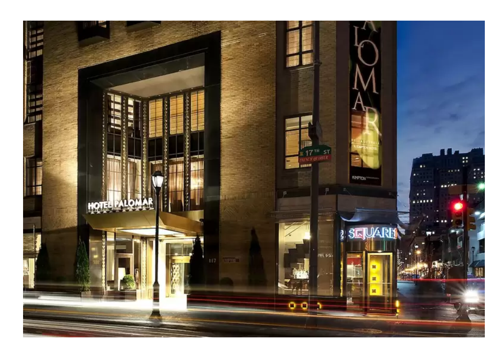
(4 Star) The Kimpton Hotel Palomar Philadelphia – Avg. 178/night