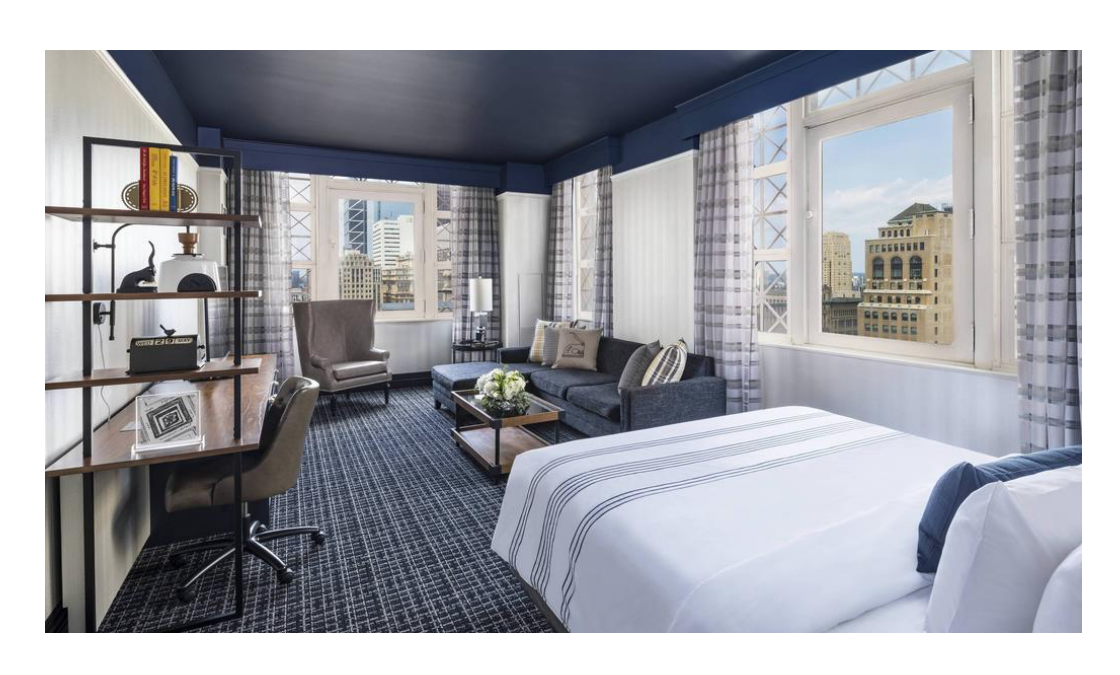
(3 Star) The Notory Hotel Philadelphia – Avg. $187/night