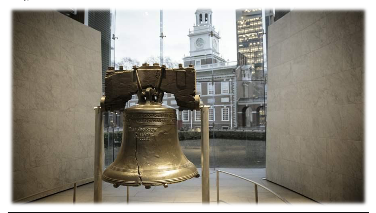
Liberty Bell, Philadelphia (created 1752)

FIRST, enacting a fair and fraud free system to elect presidents, vice presidents and representatives in our new Congress, based on accountability to know that only citizens are voting.