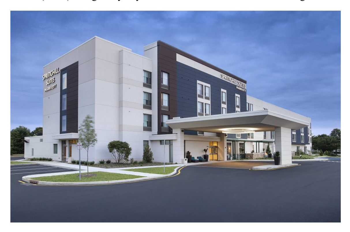
(3 Star) Spring Hills Suites Cherry Hill, NJ – Avg 98/night