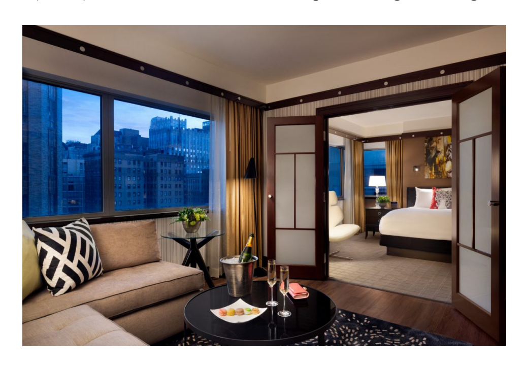
(4 Star) Sofitel Philadelphia at Rittenhouse Square – Avg. $168/night