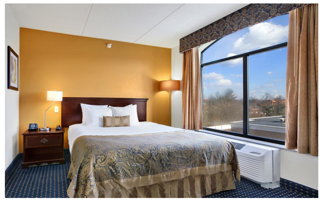
(2Star) Wingate by Wyndham Voorhees Mt. Laurel - $97/night