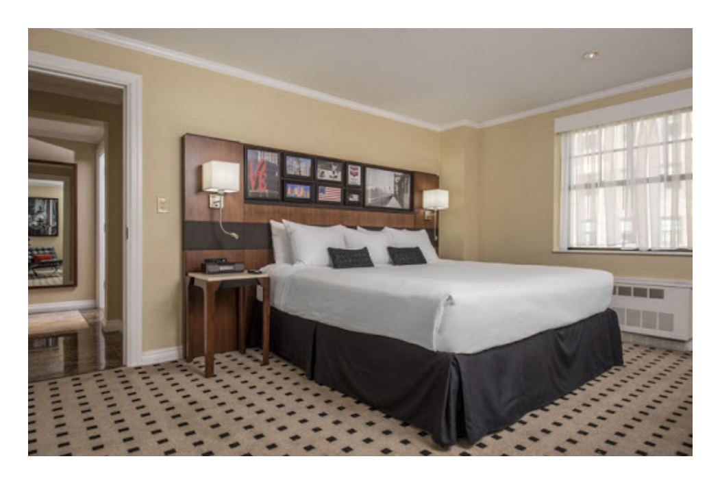
(4 Star) The Warwick Rittenhouse Square – Avg. $162/night